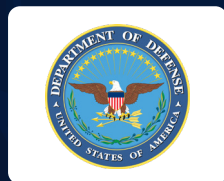
United States Department of Defense (DoD)